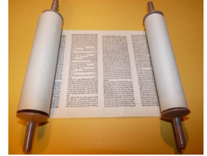
Figure 1: Torah scroll

In a heading such as ‘A reading from the book of Genesis’, we can’t use the sign ‘book’, because the Bible was not printed as a book until the fifteenth century. It is more appropriate, biblically correct and liturgically enriching, to sign ‘scroll’ as in the picture on the right.