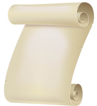
Figure 2: vertically rolled scroll

Neither can we sign the word ‘Epistle’ or ‘letter’. (the word ‘letter’ is printed because for a reader to voice-over ‘scroll’ does not sound right.) The word ‘letter’ is not appropriate to sign because in sign language a signer would use a sign depicting someone licking a stamp and sticking it on an envelope! The symbol ⇕ shows the movement of the hands for the action of unrolling a scroll. This is used for all readings from the New Testament. Greek language was used, and the writing was from top to bottom, left to right, and pages were added onto the bottom of the first page.